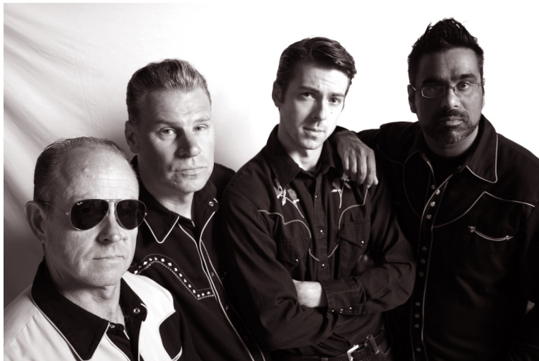
The Dodge Brothers

moments in life where you are privileged to bear witness to a unique event, this, for me was one of them. Should they saddle up and recreate this triumph at any time in the future, then my advice to anyone, is buy your ticket early." - Richard O'Brien (Rocky Horror Picture Show)